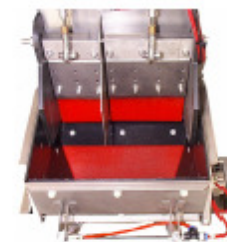
Patented Dual Chamber Accumulator