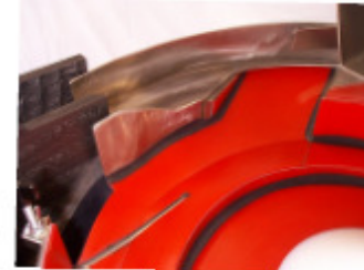
Dual Outlet Feeder Bowl for Singulated Batch Top Off