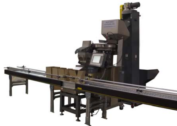
Batchmaster® FAW with Box Line