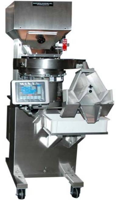
Batchmaster® IV Counter

Batching Systems, Inc. 50 Jibsail Drive | Prince Frederick, MD 20678 Phone: (410) 414-8111 sales@BatchingSystems.com BatchingSystems.com