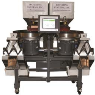
Dual Batchmaster® Counter

Our Batchmaster® Counter now includes bar code reading and Recipe Management. Advanced programming and large 10.4" color touch screen provide user friendly intuitive set-up, data monitoring, self-diagnostics, verified motion control technology, remote access, multi-language options, and custom password lock outs. The Counter analyzes product at 6,000 scans per second and can run at speeds of 100+ batches per minute. The compact design can be run by an operator in semi-automatic mode or can be integrated with a bagger, box handling equipment, blister carousel clamshell or magnetic orientation system or container handling equipment.