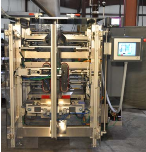
Bagmaster® 400 Bagger

The Bagmaster® 400 Vertical Form Fill and Seal Bagging Machine is a state of the art, high speed bagging system that makes bags out of flat stock film, with the bag formed around the product. It is designed and engineered for use in non-food as well as food applications and uses polyethylene and supported clear or pre-printed films.