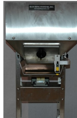
Standard 4 cuft Hopper with Vibratory Feed Tray

Bulk product pre-feeders provide easy ergonomic filling, gentle non-abrasive product handling, effective disentangling and uniform product flow.