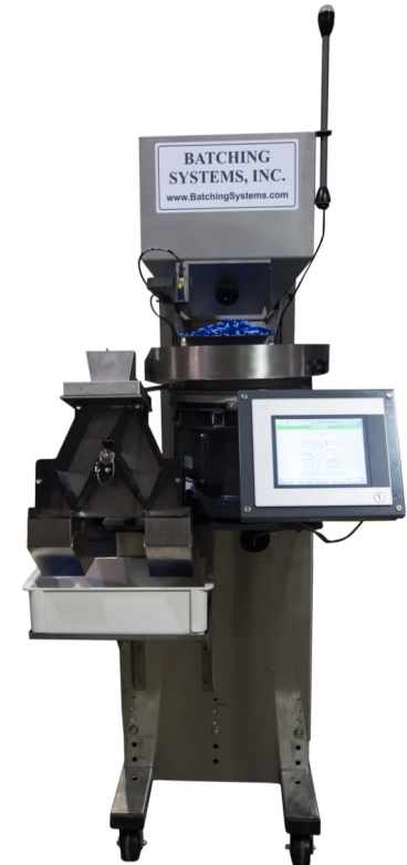
Batchmaster® IV Counter

BSI BATCHING SYSTEMS, INC. ENGINEERED AUTOMATED PACKAGING SOLUTIONS