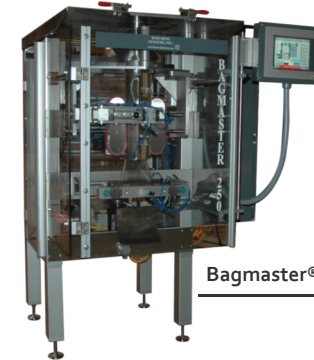
Bagmaster® 250 Bagger

Our NEW Bagmaster® 250 and 400 Vertical Form, Fill, and Seal Bagging Machines make bags out of flat stock film, with the bag formed around the product. They use polyethylene and supported clear or pre-printed films. Our NEW Bagmaster® C295 Bagging Machine will fill product into the bag being formed through the side of the bag and produces a bag without a back seal. The bagger has a 295mm wide jaw and uses flat stock, centerfold or pre-applied recloseable zipper film. The baggers can be integrated to our patented Batchmaster® Counters , Weighmaster™ Weighers , and Kit Packaging Systems or with other OEM brand fillers.