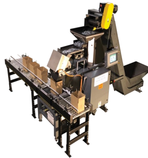
Weighmaster™ FAW-TR with Remote Load Cell