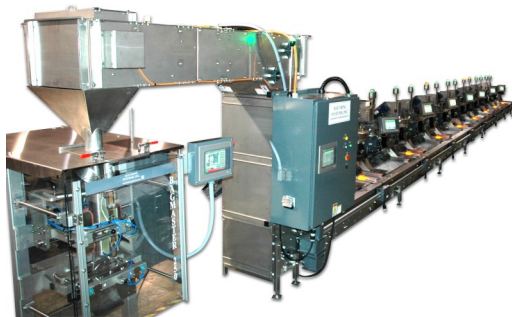
Kit Packaging System with Counters, Bagger & Conveyor

BSI provides complete engineered turnkey packaging solutions by combining our counters and weighers with a bagger and conveyor. Our kit packaging systems can produce standard or multi-cell kit bags. Up to 14 cell packs can be linked together with different print and product in each cell, or two different kits can be run at the same time. Offers refined interface and software data management, and real time data for quick and easy diagnostics to help maximize production.