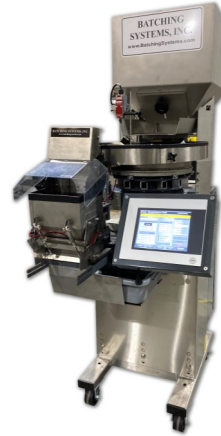
Weighmaster™ FAW24 Bowl Feed

Our NEW Weighmaster™ Fast Automatic Weigher (FAW) is now available with three different feed modes; Bowl, Tray, or Belt Feed. The original FAW24 "Bowl feed" option is still available and is excellent for de-clumping and feeding long screws 1/8" to 6" x 1.5". The new FAW-T "Tray feed" is best suited for large bulk feed batches of thin #4 washers to 4" x 1" parts. The new FAW-B "Belt feed" is a high speed quiet and gentle precision feed option for fasteners that range from 1/8" to 6" x 1.5". All three FAW feed options can be used with our "New" high speed rotary precision weigh bucket for batches under 10 pounds or our remote load cell for higher weight batch requirements. The FAW can be integrated to any container handling equipment.