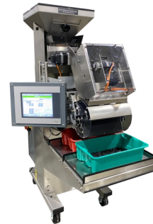
Weighmaster™ FAW-B with Rotary Bucket Assembly

Batching Systems, Inc. sales@BatchingSystems.com www.BatchingSystems.com 410-414-8111