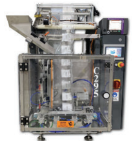
Bagmaster® C295 Bagger