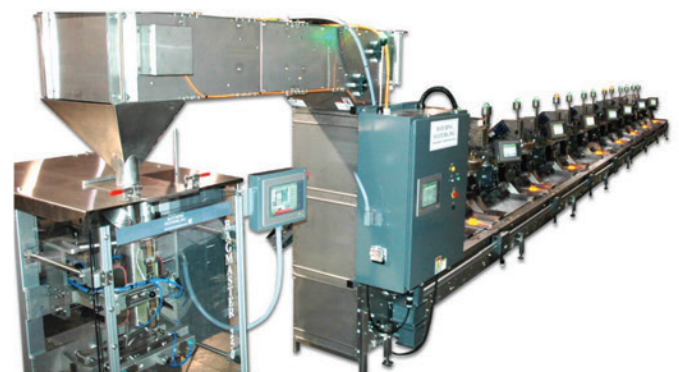
Kit Line with Batchmaster® IV Counters, Conveyor & Bagmaster® Bagger