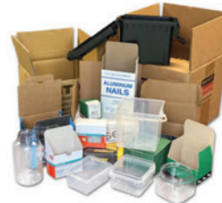
Boxes and Containers