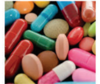
Pills and Tablets