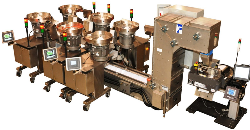
Single Batchmaster ® Counters, Bucket Conveyor, and Roll Type Bagger