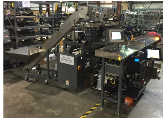
Dual Batchmaster ® Counter and Hand Feed Station

* Bulk feed hopper options that are engineered to meet your product and operation requirements are available