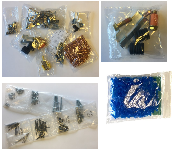
Sample Bags and Containers