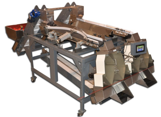
Dual Belt Feed Batchmaster ® Counter