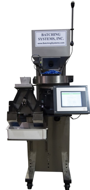
Batchmaster® IV Counter

BSI BATCHING SYSTEMS, INC. ENGINEERED AUTOMATED PACKAGING SOLUTIONS